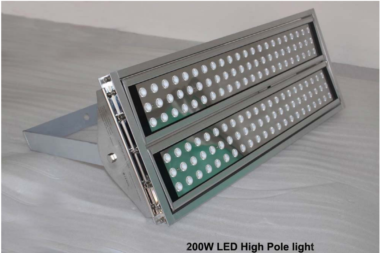
200W LED High Pole light