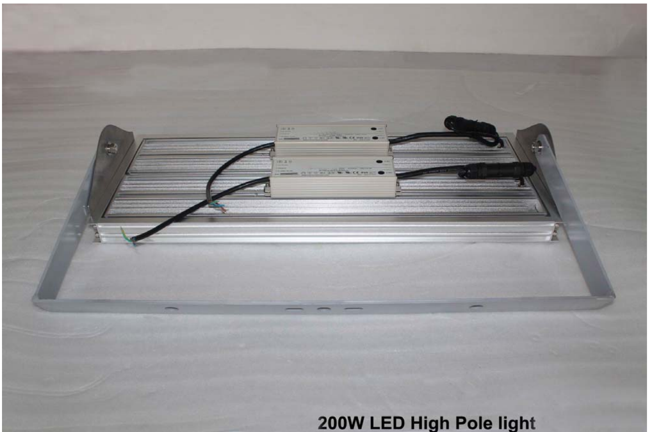
200W LED High Pole light